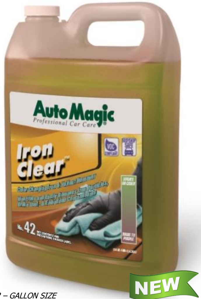
#42 – GALLON SIZE